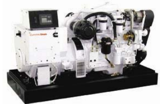
Standard model without sound shield