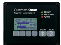
Cummins Onan Digital Display