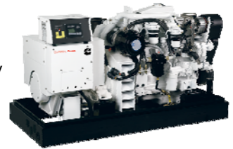
Standard model without sound shield