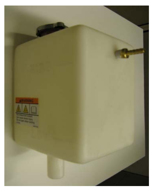
FIGURE 3. FITTING INSTALLATION