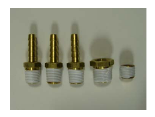
FIGURE 2. APPLY THREAD SEALANT

1. Apply thread sealant to all threads of all fittings.