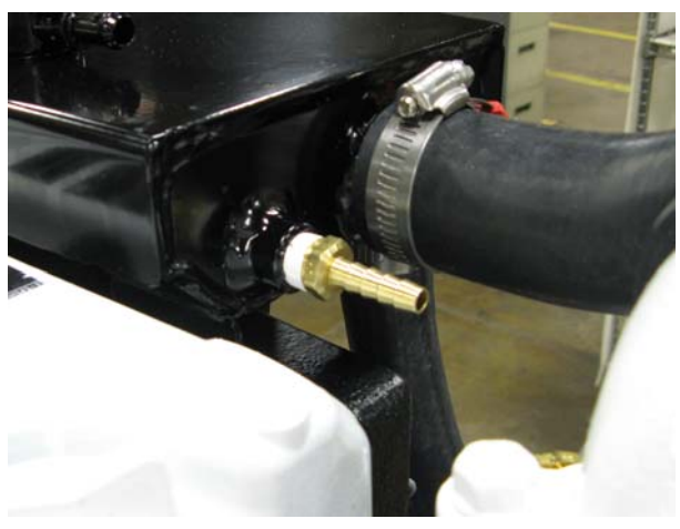
FIGURE 5. HDKBP, HDKBR, AND HDKBV MODELS