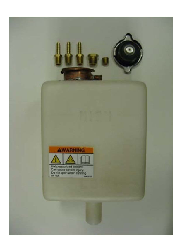
FIGURE 1. INSTALLATION PARTS

1. Apply thread sealant to all threads of all fittings.