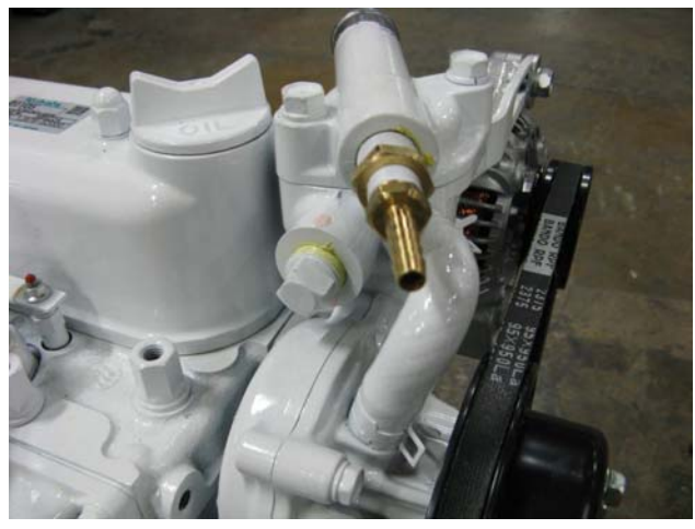
FIGURE 4. HDKBL, HDKBM, AND HDKBN MODELS