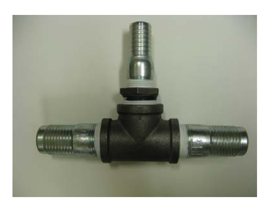
FIGURE 7. HDKBP, HDKBR, AND HDKBV MODELS