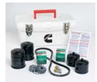
Cummins Onan Cruise Kit