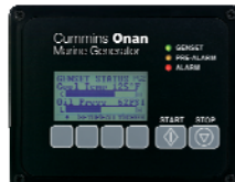
Cummins Onan Digital Display